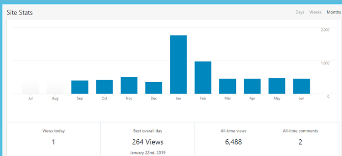
Summary of Website Performance contract July 2018 to June 2019

Beginning of year 2019, between January and February the website recorded a high hit rate. Additionally the PNGEITI website has been the most efficient resource platform that has over the years generated significant interactions from online users, most especially those that have high interest in