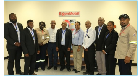
PNGEITI and Exxon Mobil Government Relations Team after a tour of Plant Site.

PNGEITI Communication programs have gained favourable results in 2018, as indicative in the use of EITI reports in framing discussions and debates across multiple platforms.