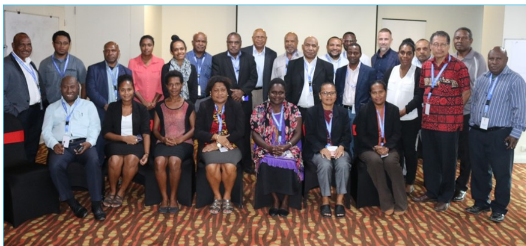
Participants of the PNGEITI PLGP Workshop comprising of Provincial Mining Directors, Provincial Administrators and Provincial Treasury Managers in June 2019.

He said the PNGEITI are embarking on creating reporting