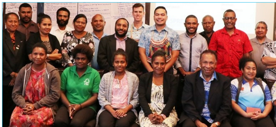
Papua New Guinea key stakeholders meet to validate SoE Report.

The PNG 2019 SoE Report is a culmination of a multi-year commitment by the PNG Government through Environmental Regulator CEPA to satisfy its Multinational Environment Agreements (MEA) Secretari-