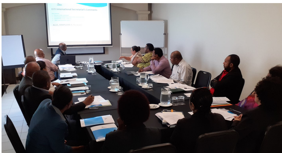
The PNGEITI National Policy and Legislation Technical Working Group (TWG) during a recent review consultation meeting in Port Moresby.

The PNGEITI Multi-Stakeholder Group (MSG) have progressed with developing PNGEITI's National Policy and Legislative Bill to provide the avenue for PNGEITI's transition into becoming an independent entity.