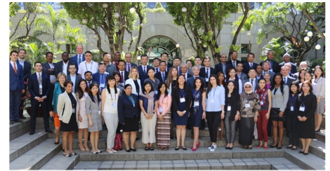
The PNGEITI MSG delegation at the Beneficial Ownership workshop in Manila, March 2019.

The PNGEITI MSG continues to actively participate and upgrade its technical expertise in Beneficial Ownership (BO) disclosure.