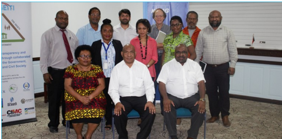
PNGEITI Multi-Stakeholder Group Beneficial Ownership TWG with BO Roadmap Implementation Manager KPMG and Madang Province Participants in 2018.